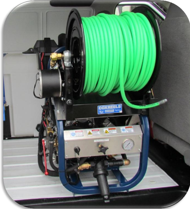
Compact Skid 9 GPM 4000 PSI (with Optional 12 volt rewind reel)