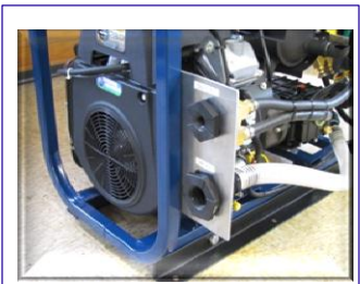
Easy Tank Connection Panel for Inlet/Return from water tank