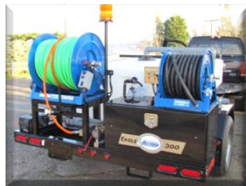
Rear View Eagle Jetter

The newly re-designed Eagle 300 Trailer Jetter now offers upgrades like Liquid-cooled gas engines (combined 62 HP), remotely mounted mufflers, a protective and aerodynamic front end enclosure, and attractive low profile appearance, offering our customers the look, feel, performance and operation of trailer jetters requiring double the investment.