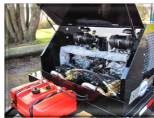
Front End Enclosure Protects Engines and Pumps