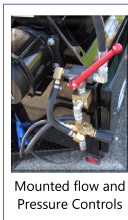
Mounted flow and Pressure Controls