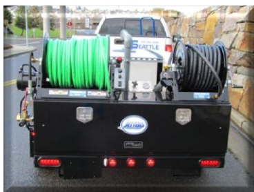
Rear View Eagle Jetter

For safety and convenience all Eagle 200 Trailer Jetters come equipped with the jetting controls located at the rear of the trailer within easy reach of the jetting hose reel ( engine start/stop, engine throttle, flow on/off, pressure adjustment, pressure gauge, hose pulsation, and hose reel speed control ). Built to feel and function like jetters 3 times the cost. The hose reel features a high torque 1/2 HP rewind motor and our solid state speed control with a speed knob for adjustment, and power wind and un-wind. The trailer is constructed of 4" x 2" box tubing and has a lifetime framework warranty. Rated at 3500 GVW w/electric brakes and break away control the Eagle 200 is built to be towed when full of water. A large, heavy-gauge steel tool bin is located at the rear of the trailer for storage of jetting tools and other gear.